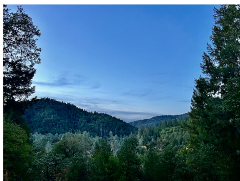
North Mountain Range View