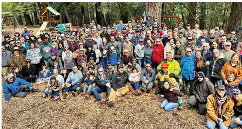
2023 Hartstone Work Day

We had over 200 people come to our annual workday! It was amazing to see the love and support in action. We were able to get so much done, thanks to all who came. Mark your calendars! Next year's work day is: Saturday, March 16th, 2024, from 9am-4pm. Morning pastries & coffee, along with a lunch, will be provided.