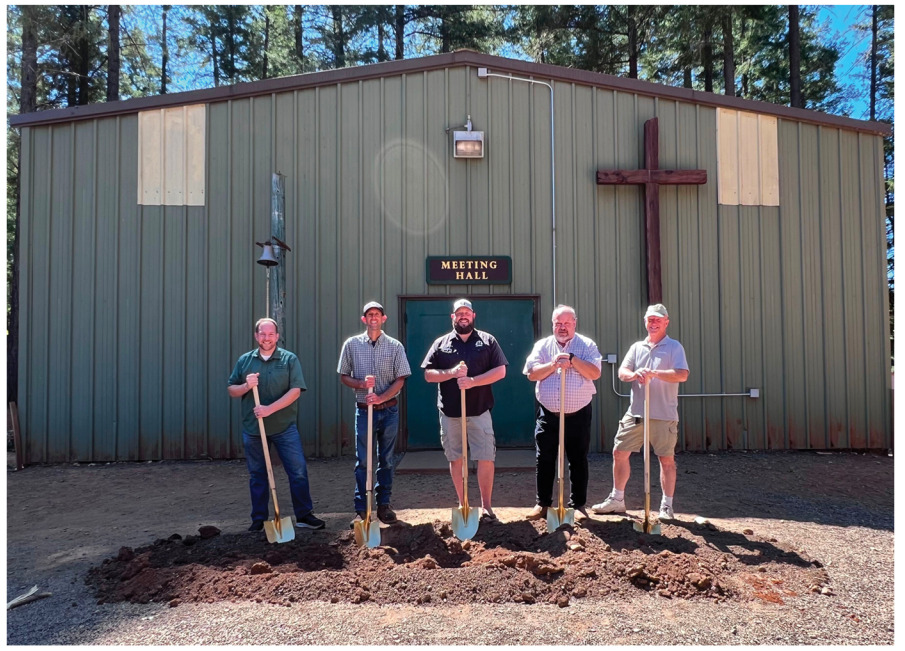
Breaking Ground with some of Hartstone's Board of Directors