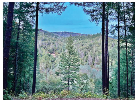
View from the Dining Hall Back Patio