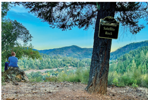
View from Satellite Rock