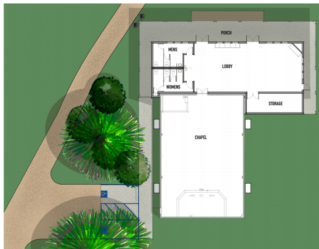
HARTSTONE BIBLE CAMP CHAPEL EXTENSION PROJECT